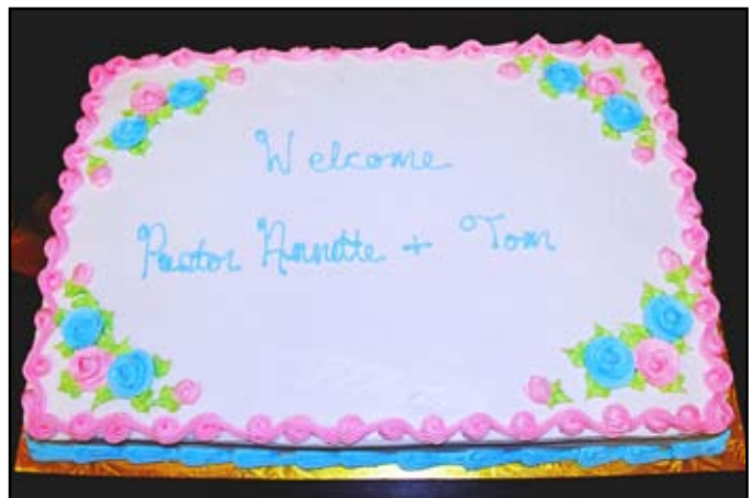
Of course, what is a party at St. Mark's without cake!

825 King St. W, Kitchener, ON N2G 1E3 (519) 743-6309 email: pastor@stmarkskw.org web: www.stmarkskw.org