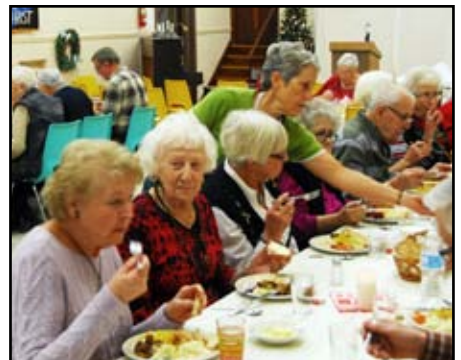
Friendship Circle Christmas Lunch